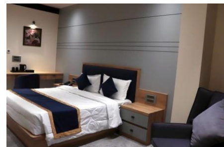
Super Deluxe Room