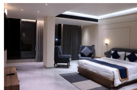
Premium Suite Room