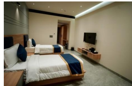
Semi Deluxe Room